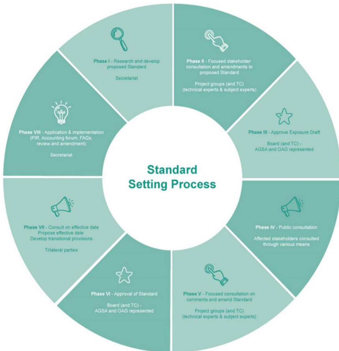
Diagram 2: Standard-setting process

6.2 The diagram should be read in conjunction with the commentary included in this section. Some of the processes may be eliminated depending on the circumstances of the pronouncement.