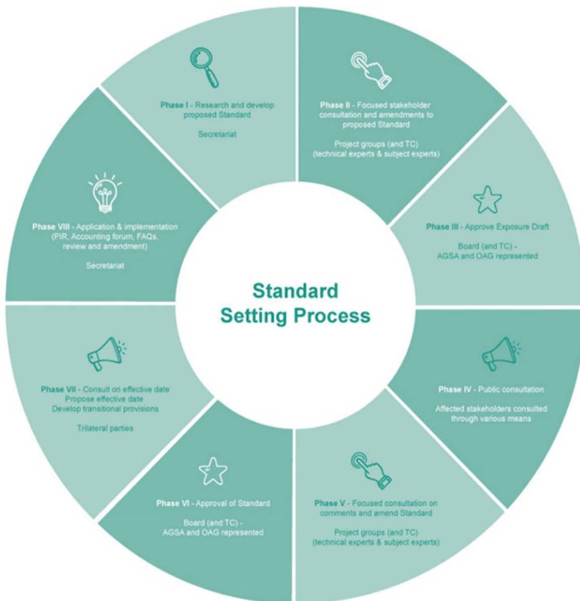
Diagram 2: Standard-setting process

6.2 The diagram should be read in conjunction with the commentary included in this section. Some of the processes may be eliminated depending on the circumstances of the pronouncement.